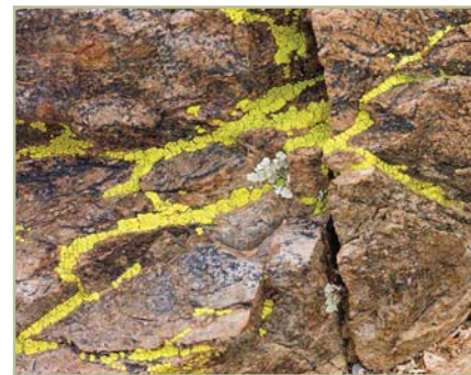
Category: Geology Division: Advanced

Get into the Preserve this April and take your best shot for conservation.