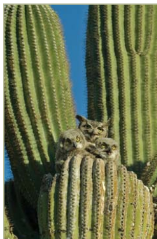
Category: Plants or Animals Division: Advanced (B. White)

Get into the Preserve this April and take your best shot for conservation.